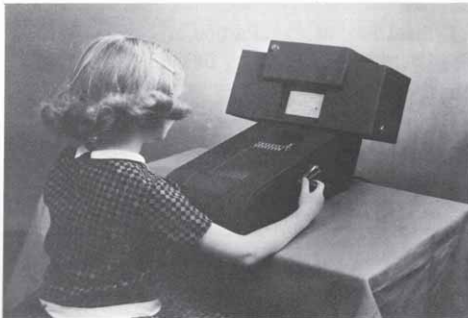
FIG. 1. A recent model of a teaching machine for the lower grades. The machine operates on the principles described in the accompanying article. Material is presented in a window with a few letters or figures missing. The pupil moves sliders which cause letters or figures to appear. When an answer has been composed, the pupil turns a crank. If the answer was right, a new frame of material moves into the window and the sliders return to their home position. If the answer was wrong, the sliders return but the frame remains and must be completed again. (This is a later version of the device described in Skinner's 1954 paper.)

In a 1954 article published in the Harvard Educational Review , B.F. Skinner foreshadowed the application of 'special techniques ... designed to arrange what are called "contingencies of reinforcement" ... either mechanically or electrically. An inexpensive device,' Skinner announced '... has already been constructed' (Skinner, 1954 (1960): 99, 109-110). The teaching machine that Skinner was referring to was not yet 'electrical'. It still used analogue technologies similar to a mechanical cash register or calculator. Some assumptions about pedagogy and assessment were written deeply into the machine. A lone child is presented material, a question is posed by the machine as substitute teacher, the student gives an answer, and then she is judged right or wrong. If right, she can move on; if wrong she must answer again. This is behaviorism epitomized, and also mechanized.